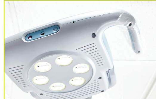
Disposable Sheath Available—Part #52630

The GS 900 Minor Procedure Light features: