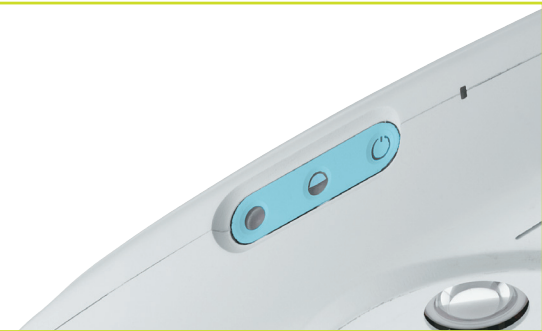
Touchless On/Off with Dimming Control