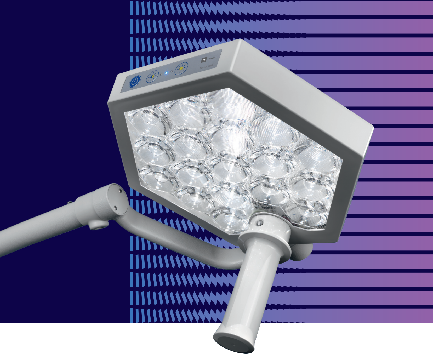
TL 1000 Exam Light Wide range of applications