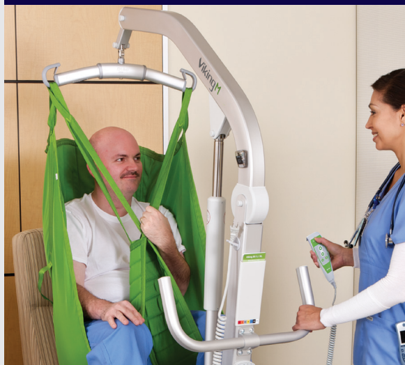
LIFTING TO AND FROM BED OR CHAIR