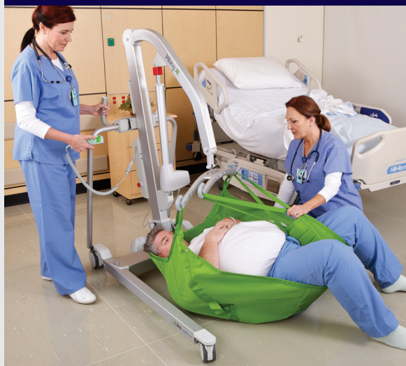
LIFTING FROM THE FLOOR