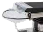
20-2001007 Uro Catcher Band 20-2001008 Uro Catcher® Bags, Case of 10