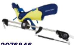
2076846 Yellofins Apex™ Stirrups Pair