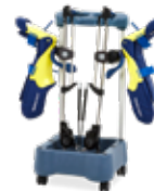
F-30015 Stirrup Cart

For more information, please contact your local Hillrom sales representative.