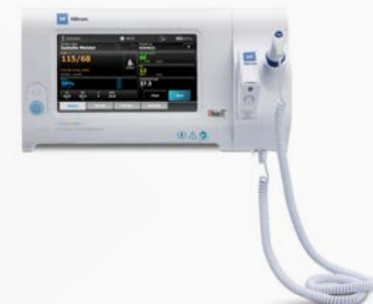
Welch Allyn Connex Spot Monitor