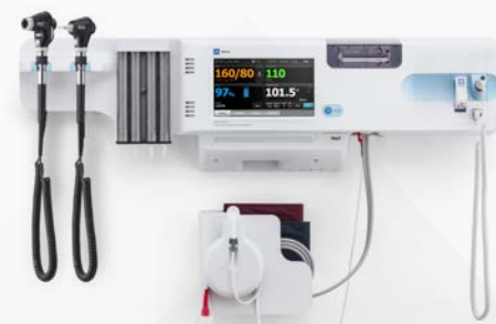
Welch Allyn Connex Integrated Wall System

Inadequate medical device software management can delay a facility's response to safety alerts, allow cybersecurity vulnerabilities to be exploited and impact patient safety. 1