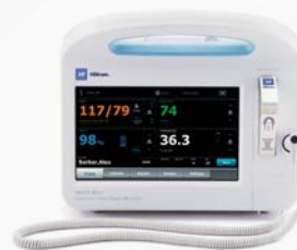
Welch Allyn Connex Vital Signs Monitor