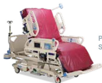
Progressa Smart+ Bed