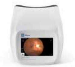
Welch Allyn RetinaVue 700 Imager