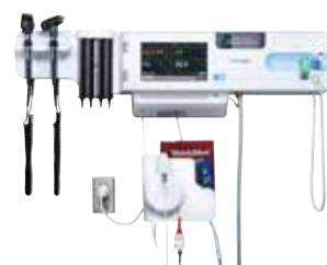
Welch Allyn Connex Integrated Wall System