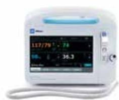
Welch Allyn Connex Vital Signs Monitor