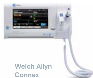
Welch Allyn Connex Spot Monitor