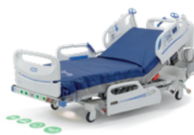
Centrella Smart+ Bed