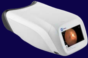
Welch Allyn RetinaVue 700 Imager