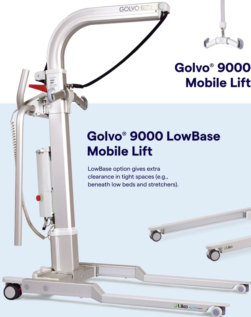
Golvo® 9000 Mobile Lift