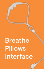
Breathe Pillows Interface