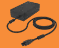
External Power Supply