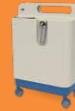
Oxygen Concentrator (Not provided by Hillrom)