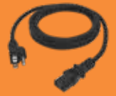
AC Power Cord

● Connect External Power Supply to Compressor