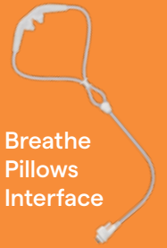
Breathe Pillows Interface