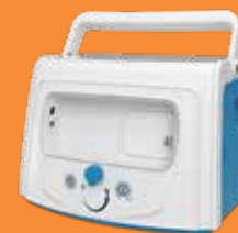
Life2000 ® Compressor