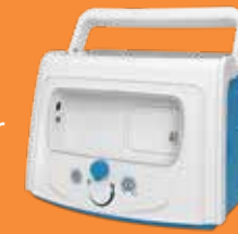
Life2000 ® Compressor