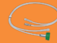
CombO 2 ® Hose