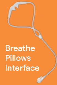
Breathe Pillows Interface