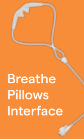
Breathe Pillows Interface