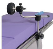
#O-UPBLC Single Circular Support 1 included