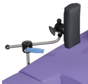
#O-UPBLR Single Rectangular Support 2 included