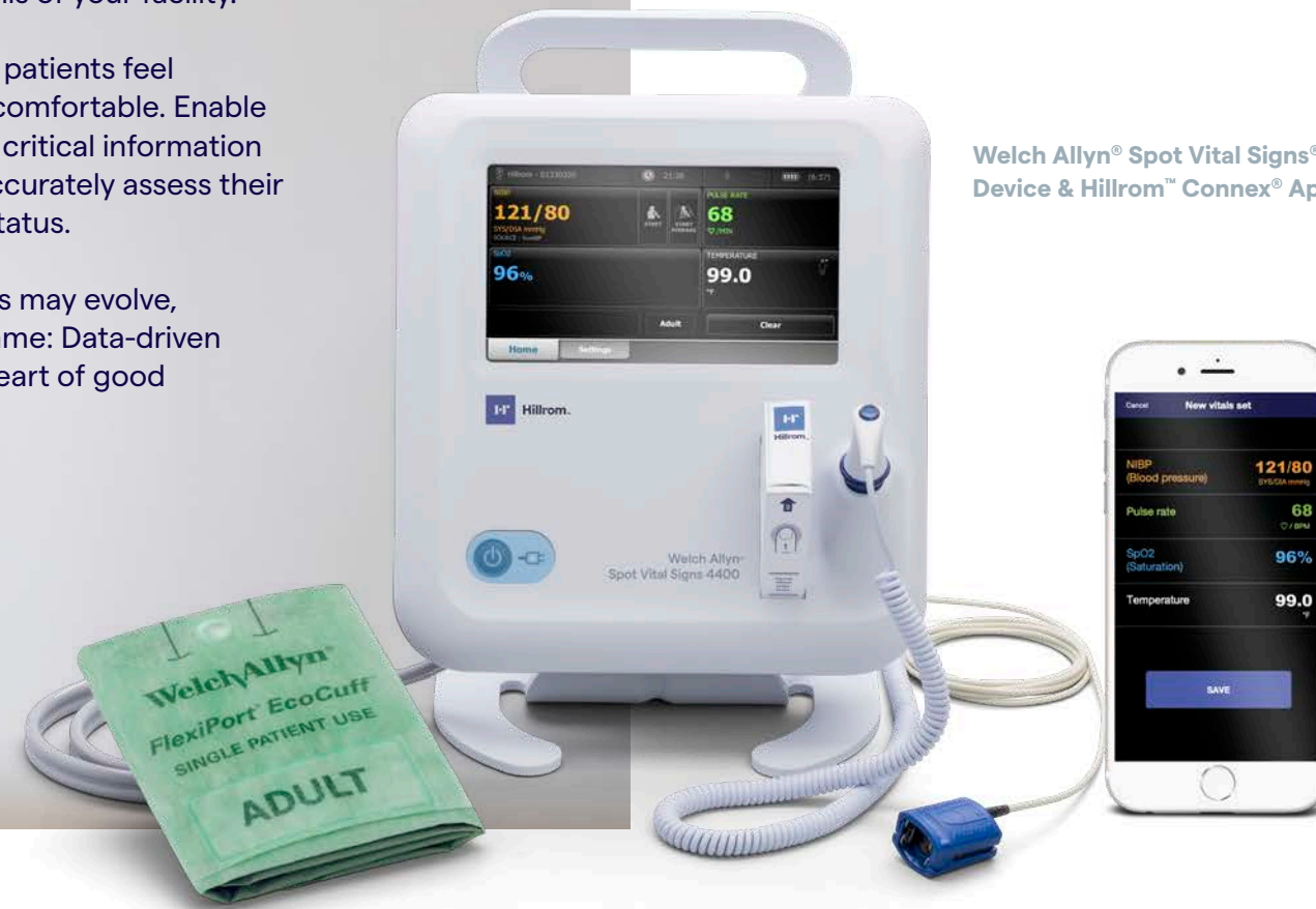
Welch Allyn® Spot Vital Signs® 4400 Device & Hillrom™ Connex® App

Technology and care tactics may evolve, but some things stay the same: Data-driven decision-making is at the heart of good healthcare.