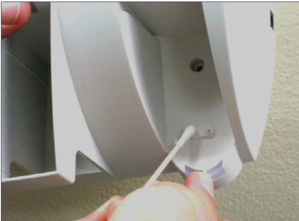
Base station dock view.

4) Clean the two contacts on the device dock: