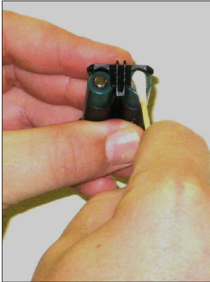
Rechargeable battery pack view.

3) Clean the two battery contacts (buttons) on the rechargeable battery pack: