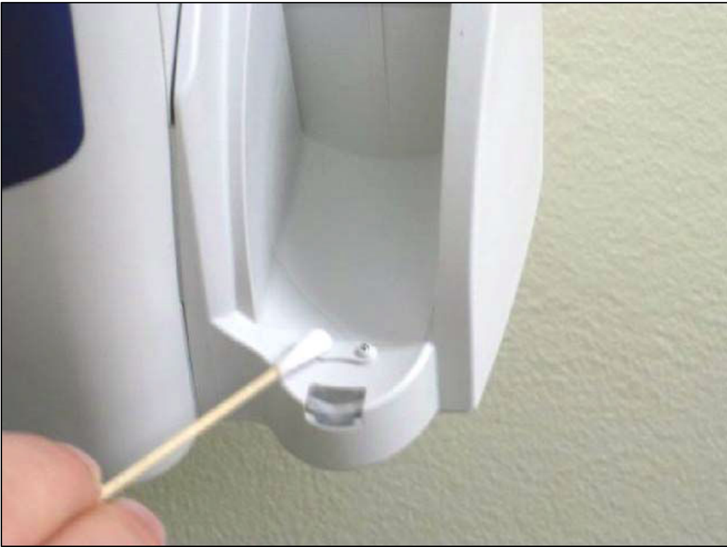
Spot LXi dock view.