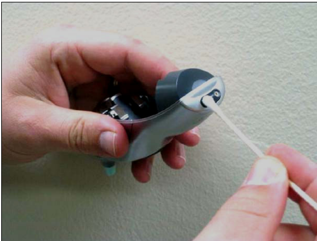
Braun external contact view.