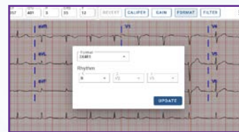
Features include clinical editing tools such as format, filters, gain, and more.