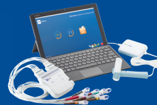
Diagnostic Cardiology Suite ECG