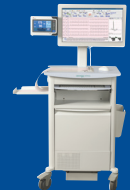
Q-Stress Cardiac Stress Testing System

The VERITAS algorithm showed a high rate of sensitivity to arrhythmias, making it most likely to detect A-Fib or atrial flutter. 2