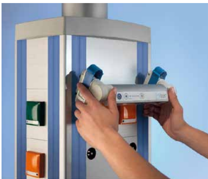
Click mechanism for comfortable, tool-free insertion of pivoting LED lamp

Special electronic workstation components can be attached to the optional MPC Rail which uses low voltage power. Function commands are forwarded via a BUS system, providing for new possibilities for workstations that are more innovative and ergonomic than ever before.