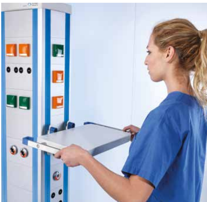
A click mechanism provides for straightforward, tool-free fixing of workstation components such as shelves on every side and at all heights of the support head

Every TruPort™ support head can be equipped with different supply modules required, from gas to electricity and data. Trained personnel can make additions or changes easily without the need for common tools, even after initial installation.