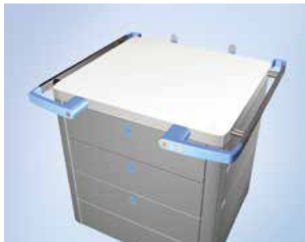
Heavy-load shelf, maximum of four drawers, with optional control handle