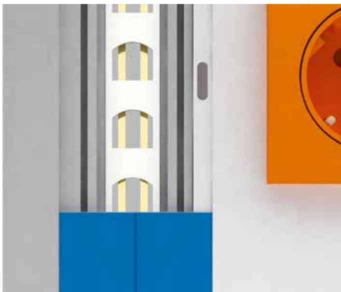
MPC Rail: intelligent with 24 V rail and integrated BUS system