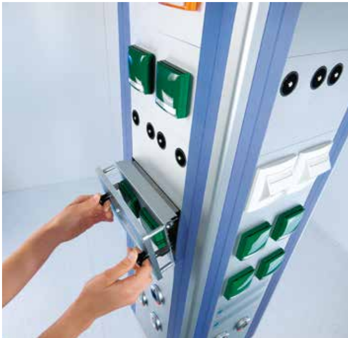
Conversion of a supply module for electricity