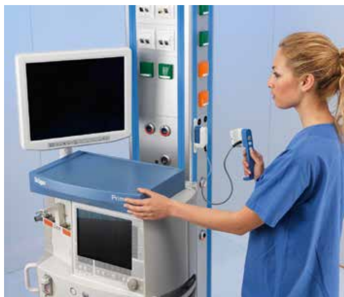
Ease of use thanks to remote control of MPC Rail – for raising the anaesthesia device and operating the brake