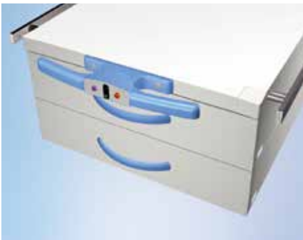
Medium-load shelf, maximum of two drawers, with optional control handle