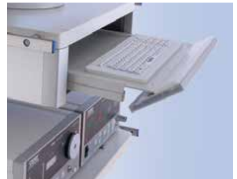
The heavy-load shelf with keyboard drawer makes it easy to document in the room; its handle-free design also makes it easy to clean