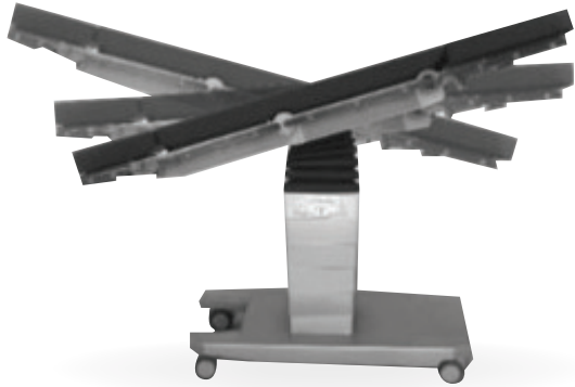
Iso centered motion: a combination of Trendelenburg or reverse Trendelenburg and slide.