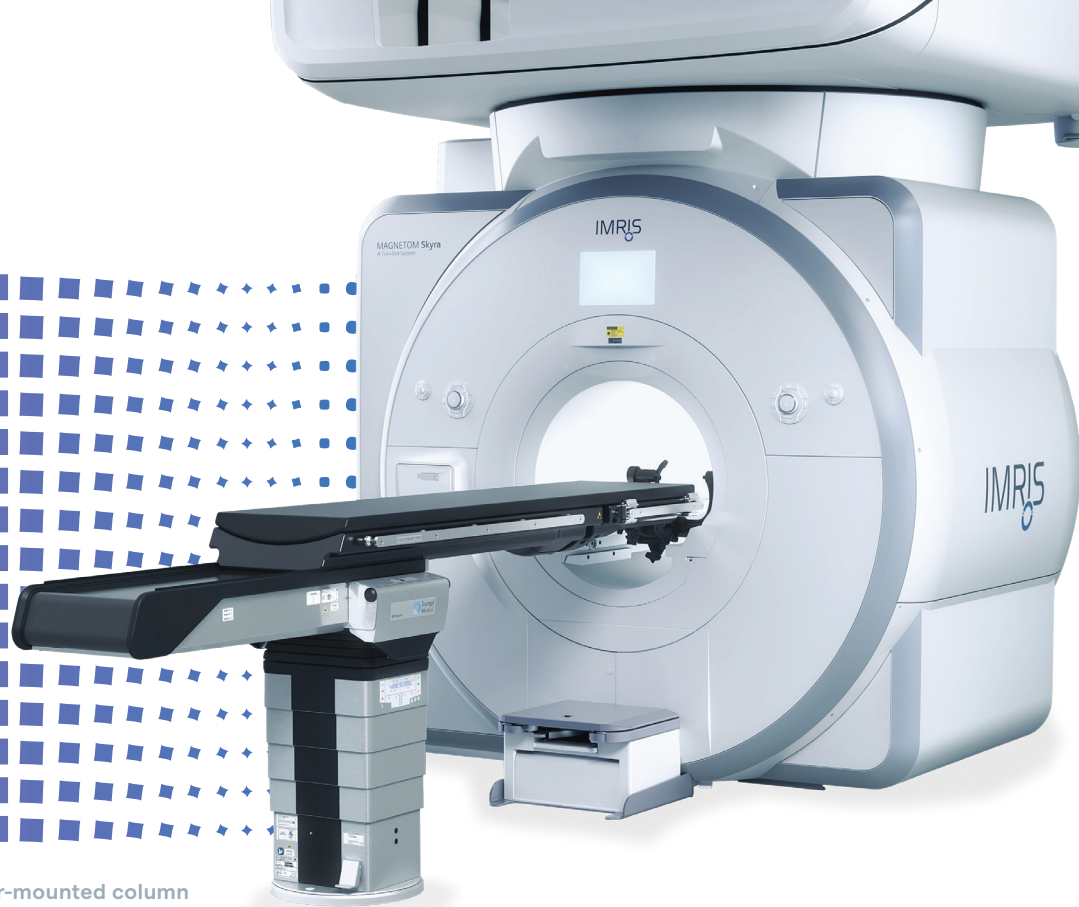
TS 7500 Surgical Table Platform with floor-mounted column and IMRIS' MR Conditional MR Neuro Tabletop.