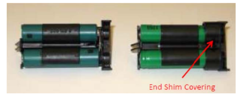
Old Battery Pack