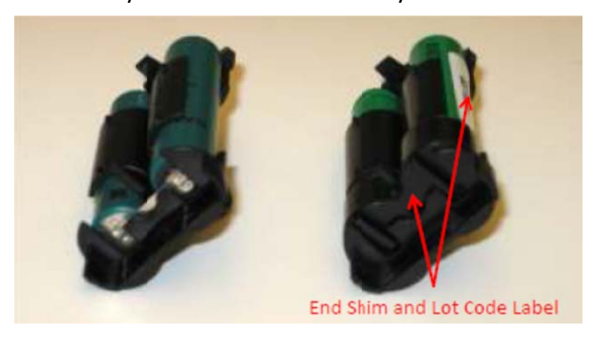
Old Battery Pack